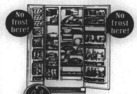
Model TFF-18DD 18.1 cu. ft. •

'Foodcenter 18' $499 WT Full-height freezer. Holds up to 225 lbs.! • Vegetable bin, meat and fruit pans • Butter conditioner • Rolls out on wheels for easy cleaning • GE colors or white