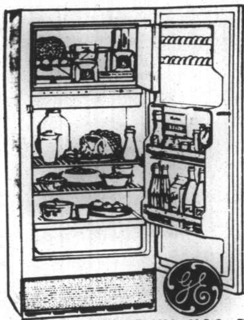
Model TA-12SC—11.5 Cu. Ft.