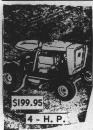
$199.95 4 - H. P.