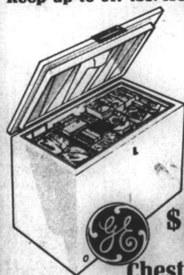
Model CB-15DD 14.8 cu. ft.

Keep up to 517 lbs. frozen foods on hand at home!