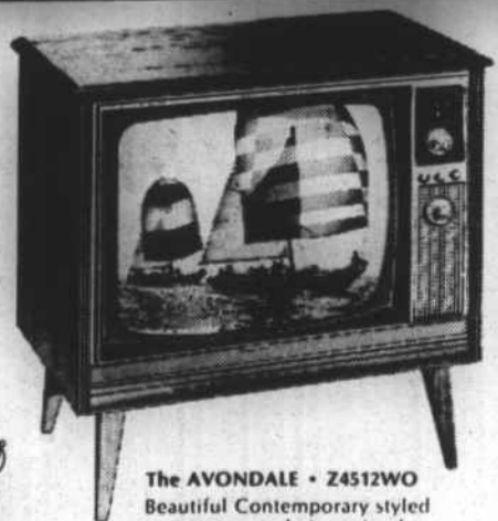
The AVONDALE - Z4512W0 Beautiful Contemporary styled compact console in grained Walnut color on select hardwood solids and veneers.

full Zenith handcrafted quality just $469.00 With Trade