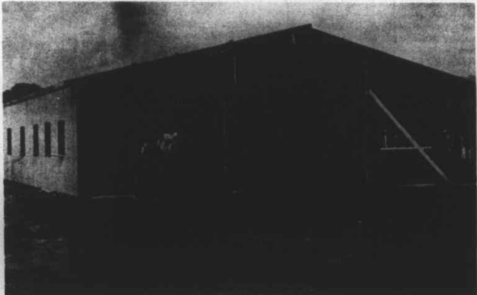
Three North Carolina State Forest Rangers are shown working on the Forest Ranger work center at Peachtree. The Rangers are doing their own construction work because of lack of funds. The building will consist of three offices and a workshop. A 1500 foot air-strip will be located directly behind the building.