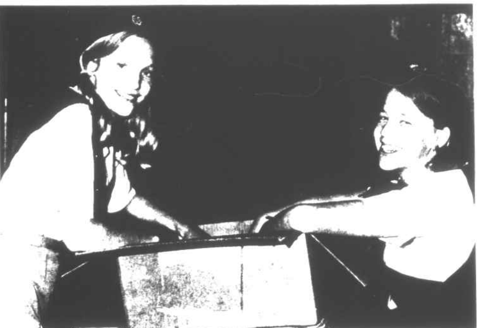
Girl Scout Week