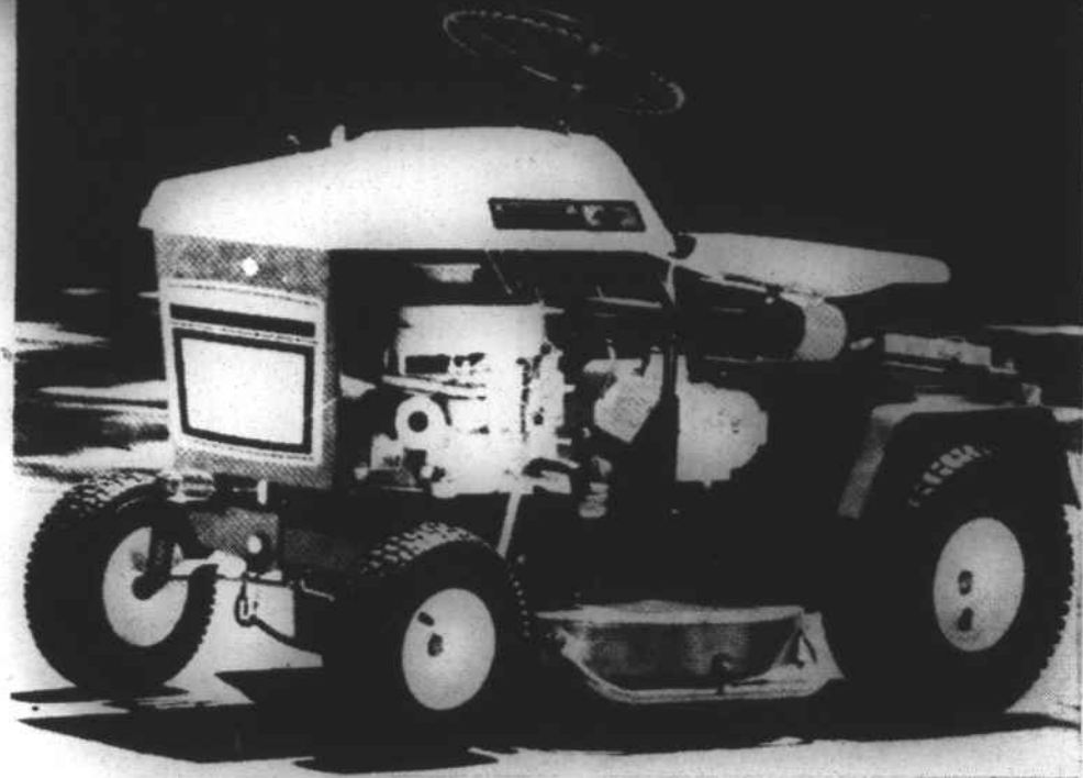
AMF RIDING MOWER Model 1278 Illustrated!