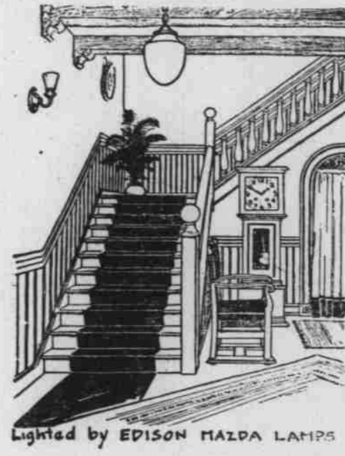
Lighted by EDISON MAZDA LAMPS

Your home can gleam this cheerful welcome into the night, no matter how old, our men can wire it quickly and without disturbing your household routine or arrangement and without dirt and disorder.