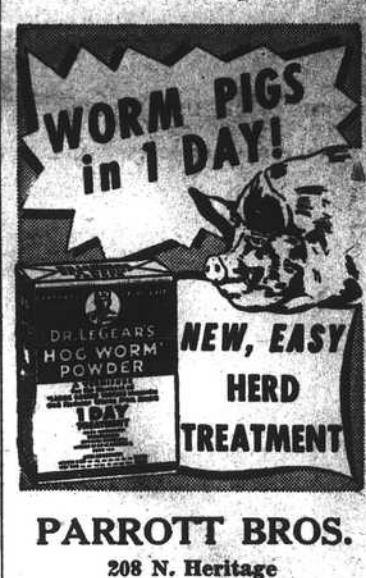
KINSTON, N. C.

Notary Public My Commission Expires 3-31-51 11-15-c