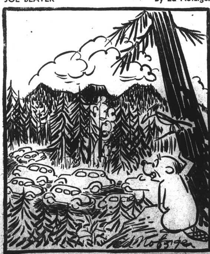
Forest Service, U. S. Department of Agriculture

"Public recreation areas in our national forests are swamped, and we must have more places to play."