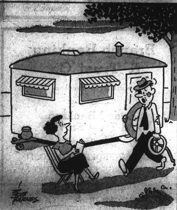
"I've been thinking it over and I've decided it's time we settled down somewhere."