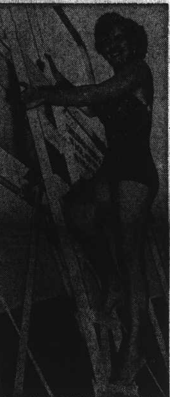
BRAVEST MARINE . . . Marine Sgt. Barbara Barnwell, 26, of Kansas City, Mo., is first woman ever to be awarded Navy-Marine Corps medal for bravery. She saved three persons from drowning.

2826 SIZES 14 1/2 - 24 1/2 2271 SIZES 2 - 6 No. 2826 is cut in sizes 14 1/2, 16 1/2, 18 1/2, 20 1/2, 22 1/2, 24 1/2. Size 14 1/2 has yoke, 35-in. long. Size 22 1/2 is cut in sizes 5 to 18. Size 41 is 74-in. long. Send for EACH pattern with name, address, style number, and size to AUBREY LAKE BUREAU, Box 369, Madison Square Station, New York 17, N. Y. The new Fall-Winter Fashion Book shows scores of other styles. No extra.