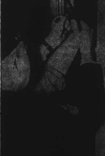
This picture, which very large cens to be just one ble in