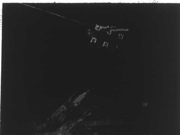
This picture shows the splintered utilities pole which was struck by the death car after it had skidded

shortly before his death. The dead man's body is under the car as pictured above, and could not be removed until after the car had been pulled away.