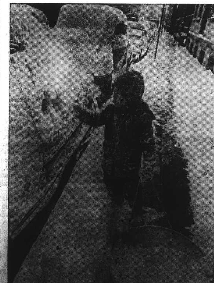
IT'S REALLY HERE—You know winter is here for good when the small ones drag sleds around wherever they go. This youngster samples the white stuff from a car in New York City.

at a site near New Bern on a million-dollar pre-stressed concrete truss plant.