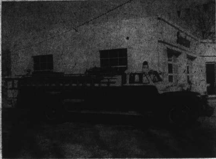
This is Pollocksville's new fire truck which arrived Saturday and was tested on Sunday afternoon

Saturday the Town of Pollocksville received its newly purchased fire truck and on Sunday a training session was held for the truck and the volunteer fire department that has been organized to use it. A large part of the people in Pollocksville saw the demonstration Sunday afternoon and was greatly impressed with the effectiveness of its high pressure fog nozzle equipment.