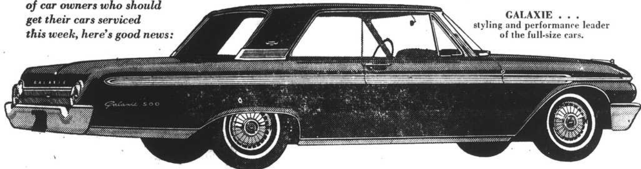
GALAXIE . . . styling and performance leader of the full-size cars.

If you're one of the millions of car owners who should get their cars serviced this week, here's good news: