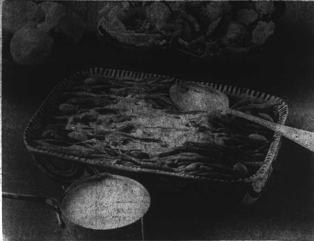
New way to enjoy green beans: Serve with a smoky cheese sauce.