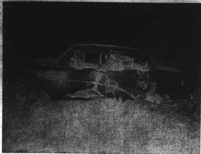
This picture shows the car that killed three children just north of LaGrange Monday night, and the position it was in when it finally came to a stop. The rear wheels were in the ditch on the east side of the road and the front wheels on the pavement. The dent in the front door of the car, at the beginning of the rear fender and on the back door came from contact with the three children.

At 9:20 Monday night three children of the same family were killed in a freak accident just outside of LaGrange on the Parktown Road.