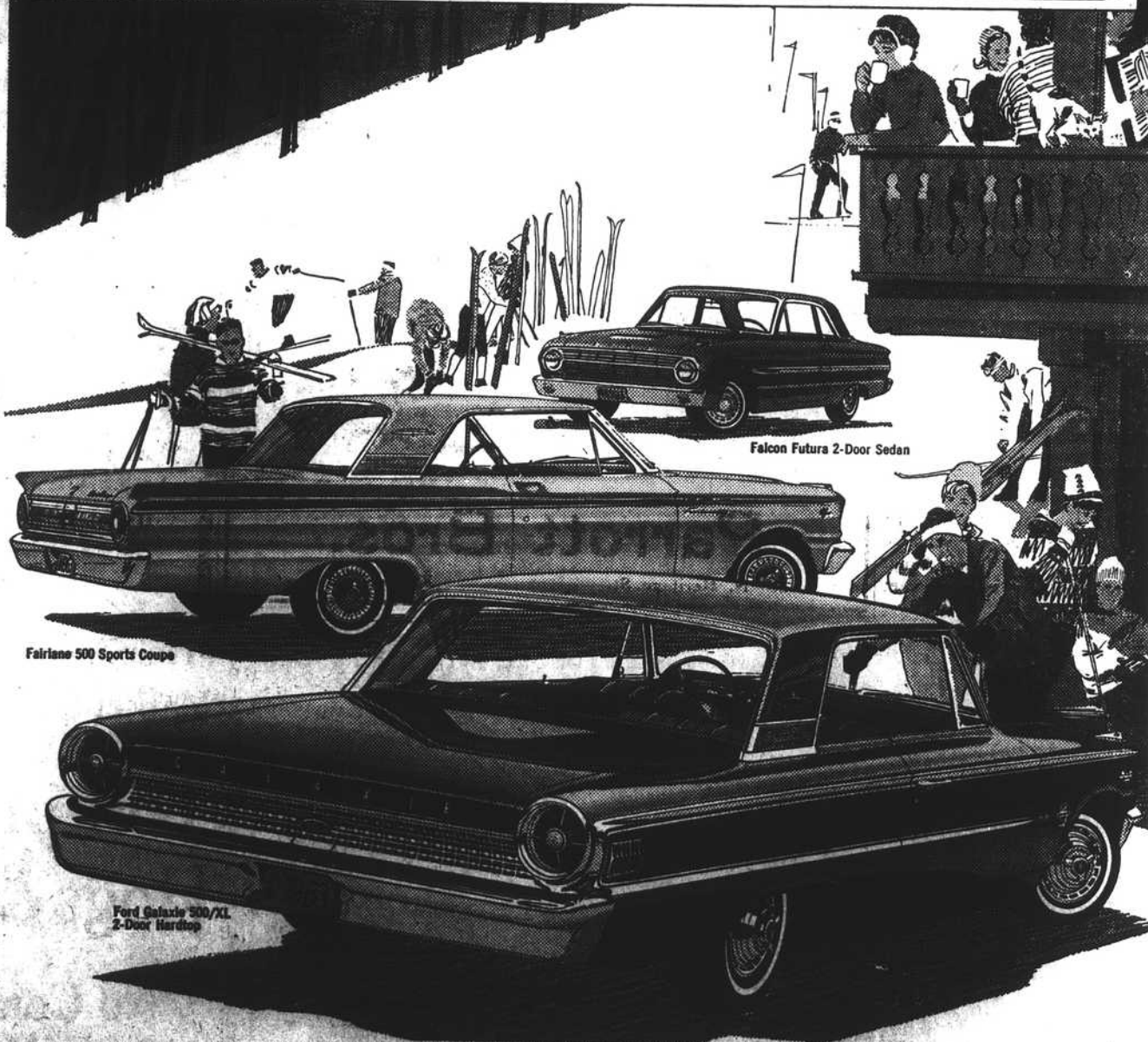
Falcon Futura 2-Door Sedan

*Except Falcon Station Bus and Club Wagons