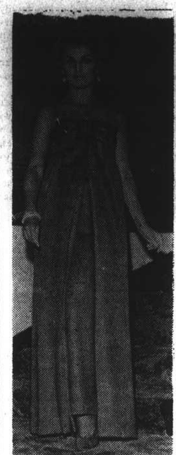
GRACEFUL STYLING — Fall evening collections feature gowns with long, flowing lines. This is a slender sheath with an over-skirt open in the front.

The grand national champion will receive a cash prize of $1,000 plus