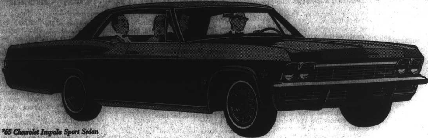
'65 Chevrolet Impala Sport Sedan