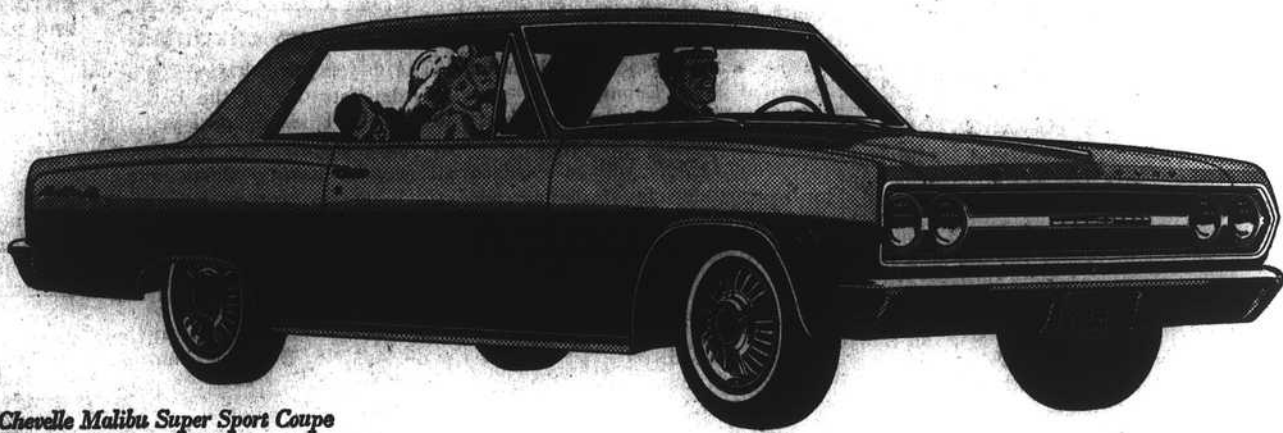
'65 Chevelle Malibu Super Sport Coupe

instrument panel that's a conversation piece. In fact, just about everything's new right down to the road. And even that'll seem newer because the Jet-smooth ride is smoother than ever.