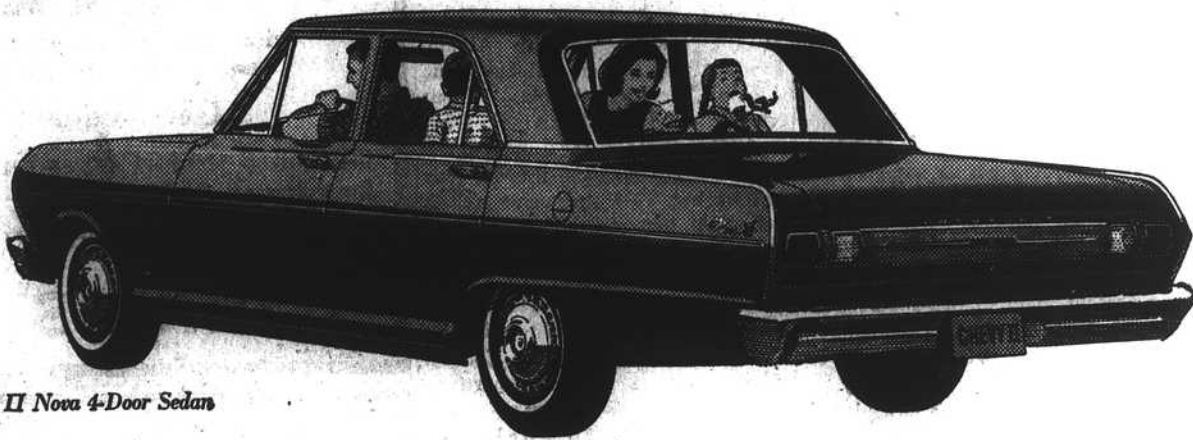
'65 Chevy II Nova 4-Door Sedan

V8 power that'll make you think we stole some of Corvette's stuff—which we did. All told, five engines are available from a quieter six to a V8 that comes on 300 horses strong.