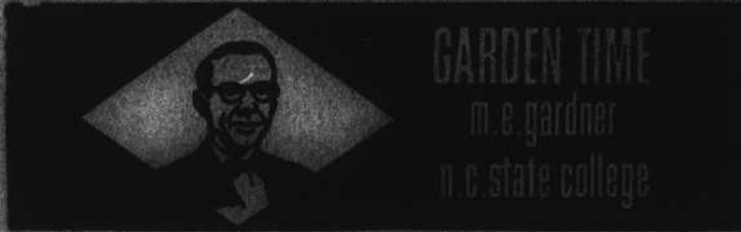
GARDEN TIME m. e. gardner n. c. state college

Quick meals need not be all cold foods. While preparing the salad and sandwiches, simmer a pot of Knorr garden vegetable soup, rich in flavor and filled with tender noodles and vegetables.