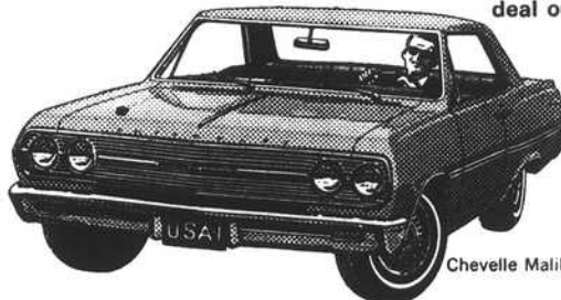
Chevelle Malibu Sport Coupe

Impala is a Chevrolet favorite, and the time to buy one is now. It's no wonder that Impala is No. 1! It's the full-size Chevrolet that offers fabulous color-keyed interiors in textured vinyl and patterned cloth. Deep-twist carpeting front and rear. Even the rich look of walnut trim on the instrument panel. Order your Impala, Bel Air, or Biscayne with the big 325-hp Turbo-Jet V8 and get the smooth performance it's designed for. Leave it to Chevrolet to make sure they look like they cost a lot; leave it to your Chevrolet dealer to make sure they don't!