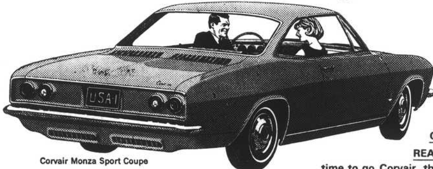
Corvair Monza Sport Coupe

HURRY! GET A GREAT DEAL NOW ON A CORVAIR, AMERICA'S FAMOUS REAR-ENGINE FUN CAR. Now's the best