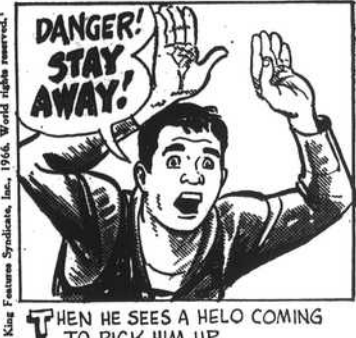
THEN HE SEES A HELO COMING