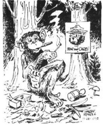
Don't monkey around with fish.