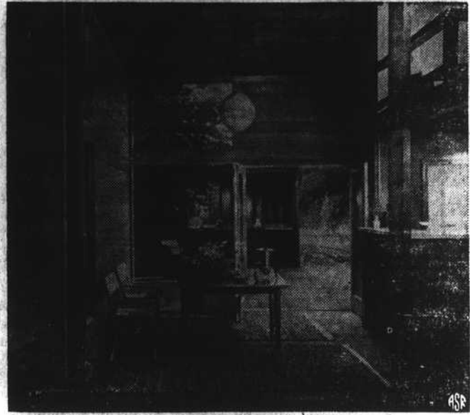
REDWOOD VACATION HOUSE binds civilization to wilderness. Note the smooth transition from interior to exterior space. High windows, part of an ingenious fenestration plan, look out to swaying tops of evergreen trees.

You can build a redwood vacation house such as the one pictured (or remodel an old cabin with redwood) for little more than the amount of money you'd spend on a new car. If the foregoing statement makes you suspect that Pinocchio is alive and writing for newspapers, one can hardly blame you.