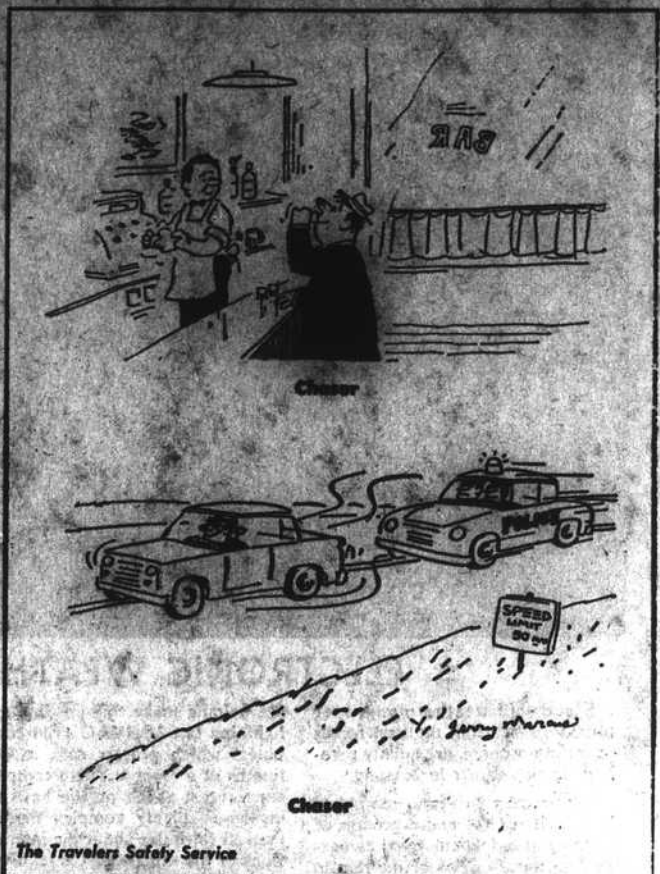
The Travelers Safety Service

Driving after drinking is a major cause of highway accidents.