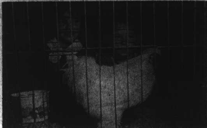
EGGS HATCHING OR JUST A CHICKEN are often a sight to behold for the little ones at the State Fair. The Children's Barnyard for years has been one of the more popular attractions at the Fair for young and old alike. It will be open during the entire run, Oct. 17-25.