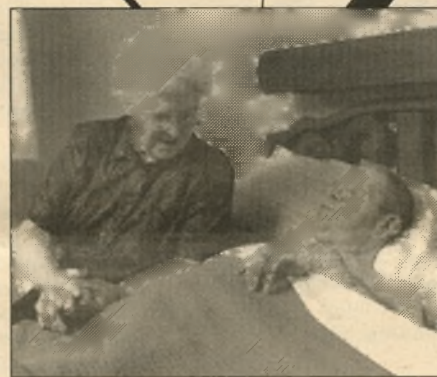
◀ Triangle Hospice "Capital Consortium's staff has particular expertise in North Carolina and its leadership. This has been especially beneficial to our campaign effort." Terry Sanford (Campaign Chair)