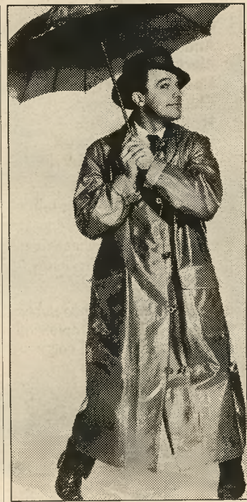
A month of Gene Kelly at the NC Museum of Art