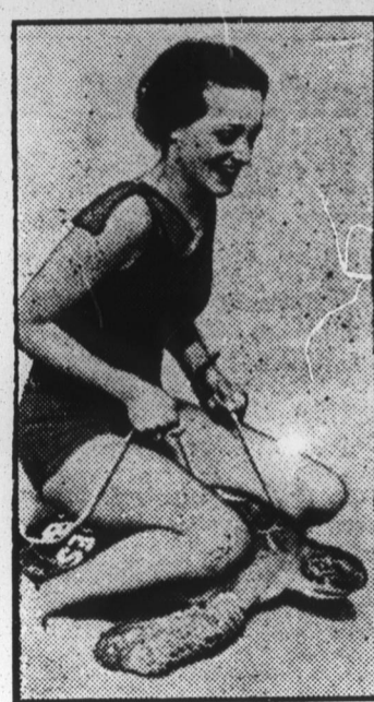
"Get along, little turtle, get along..." You'd imagine even a terrapin would want to oblige this fair Miami mermaid, but the little old codger apparently has a heart as hard as his shell, and won't put on a spurt even if loss of the race means his name will be soup.