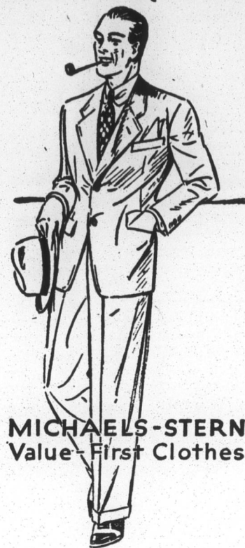
MICHAELS-STERN Value-First Clothes

The perfect summer suits... Tailored by Michaels-Stern... for men who want to look cool under the most adverse circumstances... single and double-breasted models... business models and sport models... with or without vest... many with extra trousers... skeleton lined... cool wool... Biweves... Triweves... Far East... Tropicans... Botany Leaf Cloths... Congo Cloth... Venetians... Gaberdines... and a host of other distinctive fabrics. There is bound to be something that will please you. We shall be happy to show you through our complete stocks.