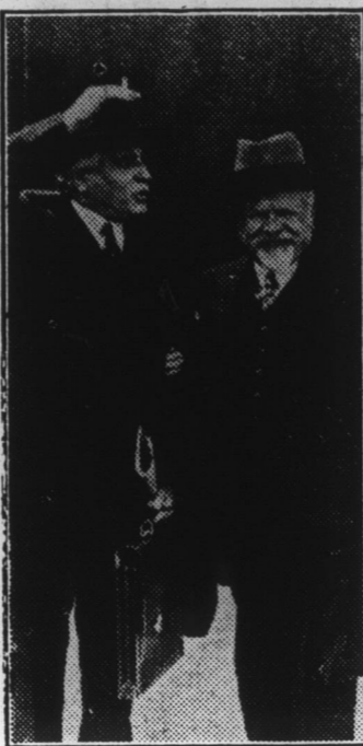
FRENCH CABINET CHANGES

As a fifth step, the farmer makes a formal application for payment for what he has done, and finally