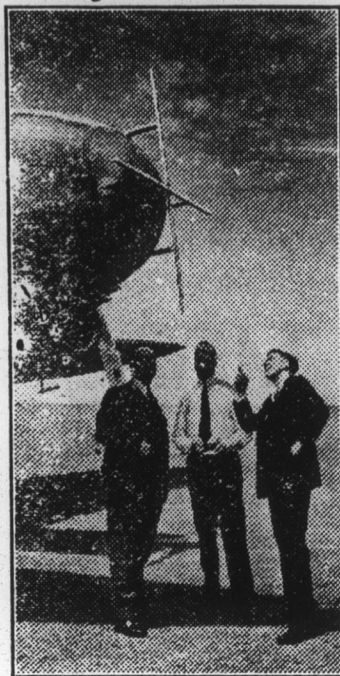
WEER MAKES BLIND LANDING

The dramatic story of "Magnificent Obsession" is said to be the screen's outstanding example of poignant emotion, with the mysterious "obsession" exerting a powerful influence on the characters' lives. The cast supporting Miss Dunne and Robert Taylor includes Charles Butterworth, Betty Furness, Sara Haden, Ralph Morgan, Henry Armetta and Gilbert Emery. The story