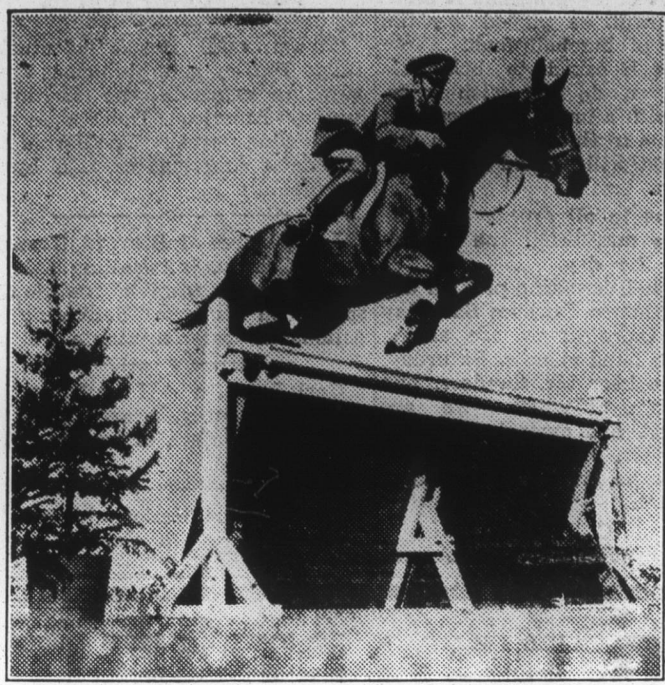
MAY REPRESENT U. S. AT THIS YEAR'S OLYMPICS

Max Schmeling, former world's heavyweight champion, trains for match with Joe Louis in New York this week.