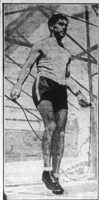
ON EVE OF BATTLE

Max Schmeling, former world's heavyweight champion, trains for match with Joe Louis in New York this week.