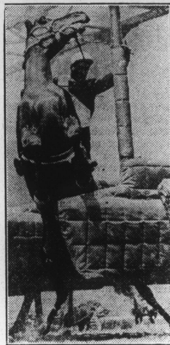
TEMPERMENTAL RACER Clingendael rears at starting stall, unseats jockey and runs away at Belmont Park, New York.