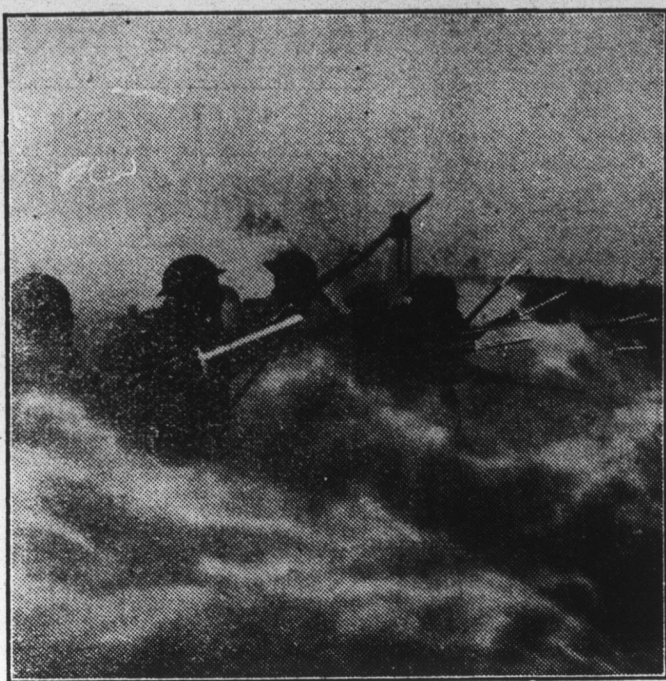
SECOND ARMY CORPS IN MIMIC WARFARE Near Fort Knox, Kentucky, 21,000 U. S. regulars and National Guard troops are engaged in a theoretical attack on Nashville, Tenn. Later they will move against Pittsburgh, and before the end of the month 50,000 troops will be under arms.