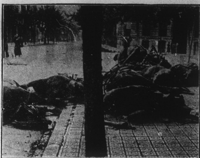
IN THE WAKE OF THE SPANISH REBELLION In an encounter in one of the principal streets of Barcelona, between Government troops and Fascist rebels, these Civil Guard mounts were caught in a cross-fire and destroyed. Military observers predict a long drawn-out civil war in Spain.