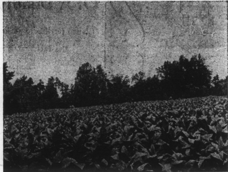
Tobacco scene from the farm of W. C. Hawkins. A splendid example of the kind of tobacco raised in this section.