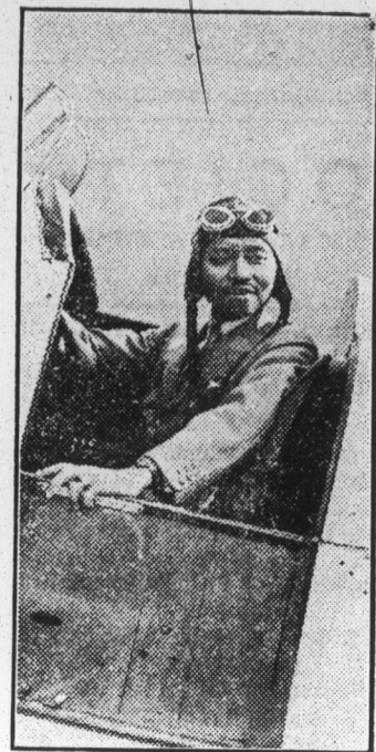
EX-KING WINS LICENSE Prajadhipok, Siam's former ruler well known in America, passes his solo flight test at English airport.

Returning, he became a "heavy" and became "box office" in "Robin Hood," "Richard, the Lion-Hearted," "The Sea Hawk" and other hits. A return to comedy found him co-starring with Raymond Hatton. Then he joined M-G-M and was seen in "The Champ," "Grand Hotel,"