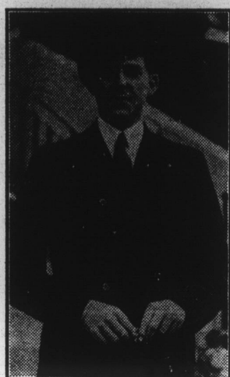
HEIR TO SPANISH THRONE Don Juan, Prince of the Asturias, second son of Alfonso, choice of Royalists in event of a restoration of the monarchy.

Dealers from all over the two Carolinas will assemble at Charlotte on Wednesday where they will board a special train for the ride to Detroit, arriving there for