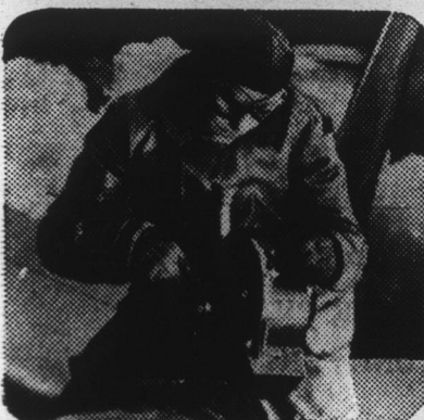
says TONY MANERO, 1936 OPEN GOLF CHAMP. "When I enjoy Camels," Tony adds, "I have a feeling of ease afterward."