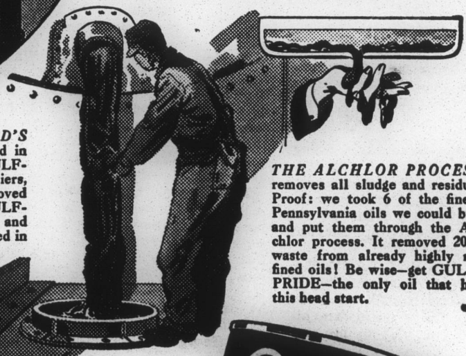
THE ALCHLOR PROCESS removes all sludge and residue. Proof: we took 6 of the finest Pennsylvania oils we could buy and put them through the Alchlor process. It removed 20% waste from already highly refined oils! Be wise—get GULFPRIDE—the only oil that has this head start.

Read the facts on this page. Then drive into any Gulf dealer's—and replace your old summer-worn oil with GULFPRIDE now.