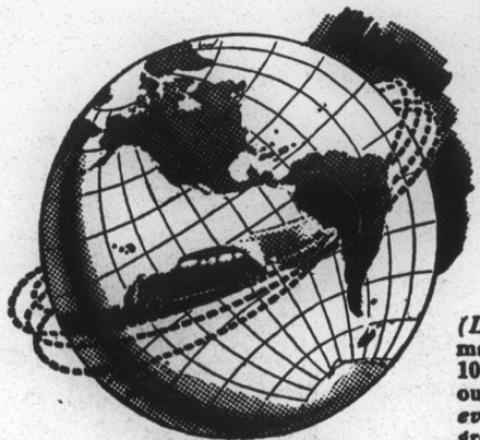
(Left)—4 TIMES AROUND EARTH. A man drove his automobile on GULFPRIDE OIL 100,000 miles—without ever needing a repair, without ever having the head off the motor, without ever adding one drop of oil between drains. Expect great things of GULFPRIDE—you'll get them!

WHY is it that no other motor oil in all the world can deliver the performance of GULFPRIDE OIL?