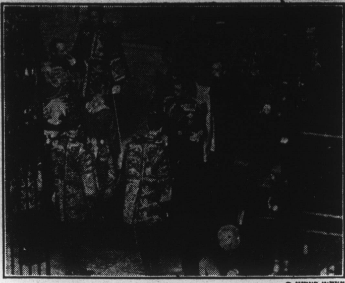
EDWARD VIII OPENS HIS FIRST PARLIAMENT

Discarding the traditional royal "We," King Edward reaffirmed the British Empire's adherence to the League of Nations and urged wide social and industrial reforms. He is shown leaving the House of Lords attended by heralds and pursuivants in ancient pageantry.