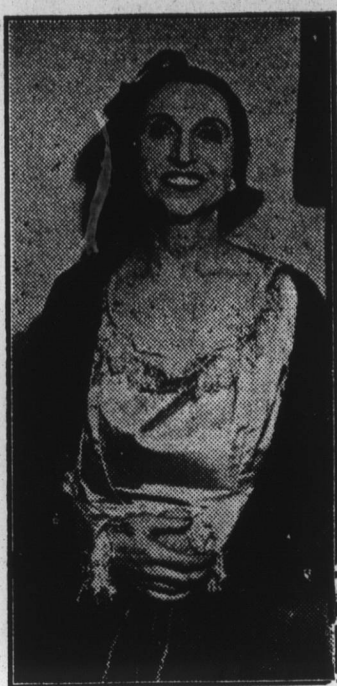
TRIES HER NEW VOICE

Clague estimated that 140,000 persons in North Carolina will be eligible for old age pensions the