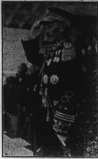
GENERAL CHIANG KAI-SHEK Grave concern is felt for National Chinese leader who is a prisoner of Marshal Chang Hsueh-liang.

To answer the rapidly increasing public demand for the new Oldsmobile Sixes and Eights, production been stepped up to more than 1,000 cars daily — the highest sustained daily level ever maintained by Oldsmobile.