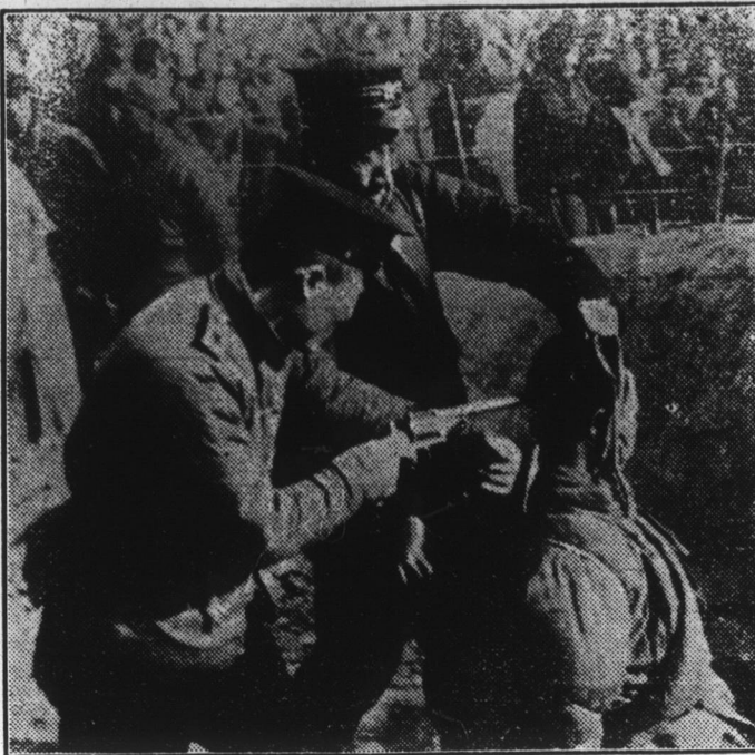
CHINA EXECUTES NARCOTIC ADDICTS

Directed by Joseph Kane the picture also features Lon Chaney