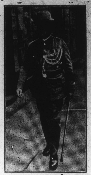
GERMAN COLONIALS APPEAR For the first time since divested of

her colonies, German officers revive her former colonial uniforms.