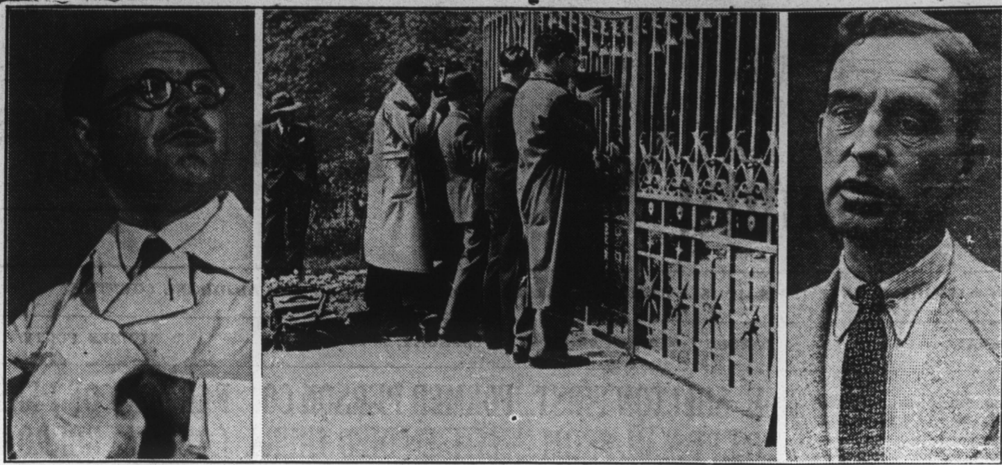
CORONATION OVER, THE ROYAL SCENE SHIFTS ACROSS THE CHANNEL