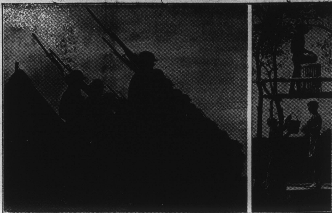
CITIZENRY PREPARES FOR SUMMER TRAINING

If the crop is small and good prices will probably be higher