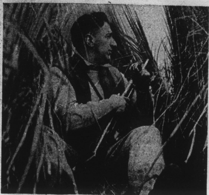
Armed with a big gun and a miniature camera, this duck hunter waits in his blind for some of the winged targets to come along. This snap of a snapping nimrod was taken on Tawas lake, far-flung preserve in the northern part of Michigan's lower peninsula.