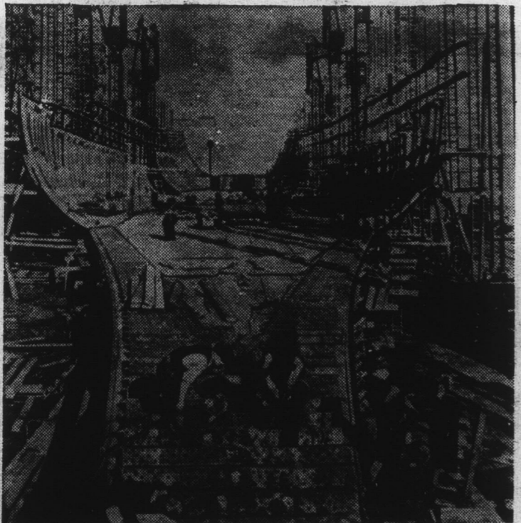
First photograph of the new 32,000-ton Cunard White Star liner, as yet known only as No. 1029, shows a view of the hull skeleton, looking toward the stern on the stocks of the shipyard at Birkenhead, England. This is the largest ship ever laid down in England.