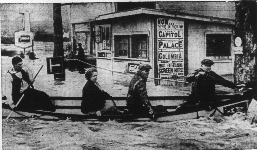
Victims of raging Potomac river flood waters are evacuated from their inundated homes by a rescue boat at Bladensburg, Md. More than 1,000 homeless persons waited for the waters to subside before returning to their dwellings.