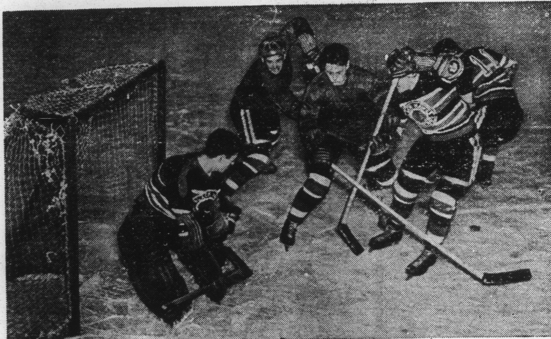
Members of the Chicago Blackhawks make a concerted attack on the enemy goalie in an attempted scoring drive as the team opens its season with the New York Americans at the Chicago Stadium.