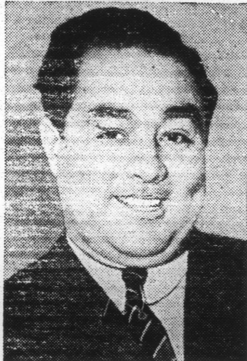
A million-dollar contract for appearances in movies, radio broadcasts and professional golf matches was signed by John Montague, famous golfing friend of Hollywood notables after his acquittal recently of the seven-year-old first-degree robbery charge on which he was brought back to Elizabethtown, N. J. Montague, whose real name is LaVerne Moore, was a mystery man in Hollywood for a number of years.