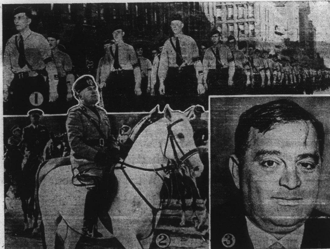
1—Members of the German American Bund, a Nazi organization, pictured as they paraded in New York recently. 2—Premier Mussolini on the Arabian horse recently presented to him by the king of the Yemen in southeastern Arabia, reviews members of the Roman police force. 3—Fiorello LaGuardia, first "reform" mayor of New York city ever to succeed himself, shown after his recent victory over Judge Jeremiah T. Mahoney, Democratic nominee of Tammany Hall.