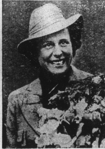
Leni Riefenstahl, who received the film prize for this year for her Olympic film of last year. This photograph was taken on the occasion of her recent visit to Vienna. Leni is said to be the film favorite of Reichsfuehrer Adolf Hitler and there is a persistent rumor that if the chancellor ever marries, she will be the bride.