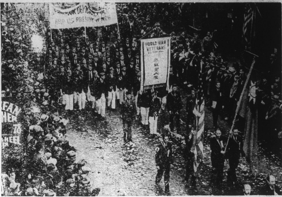
Leading a march of 20,000 Chinese who paraded through downtown New York as a symbol of unity against Japanese aggression were 60 Chinese veterans of the A. E. F. The parade, dramatizing China's life-and-death struggle for peace, justice and democracy drew several hundred thousand spectators and lent encouragement to the relief drives for civilian victims of the war in the Far East.